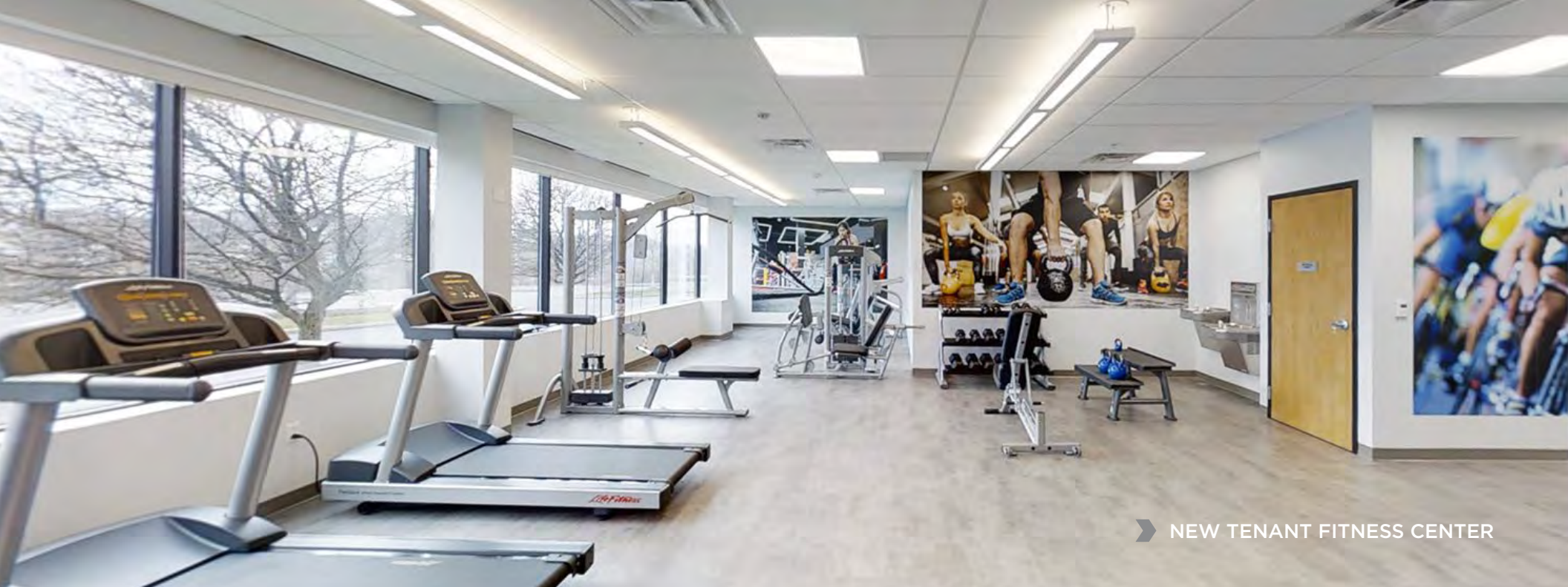
➤ NEW TENANT FITNESS CENTER