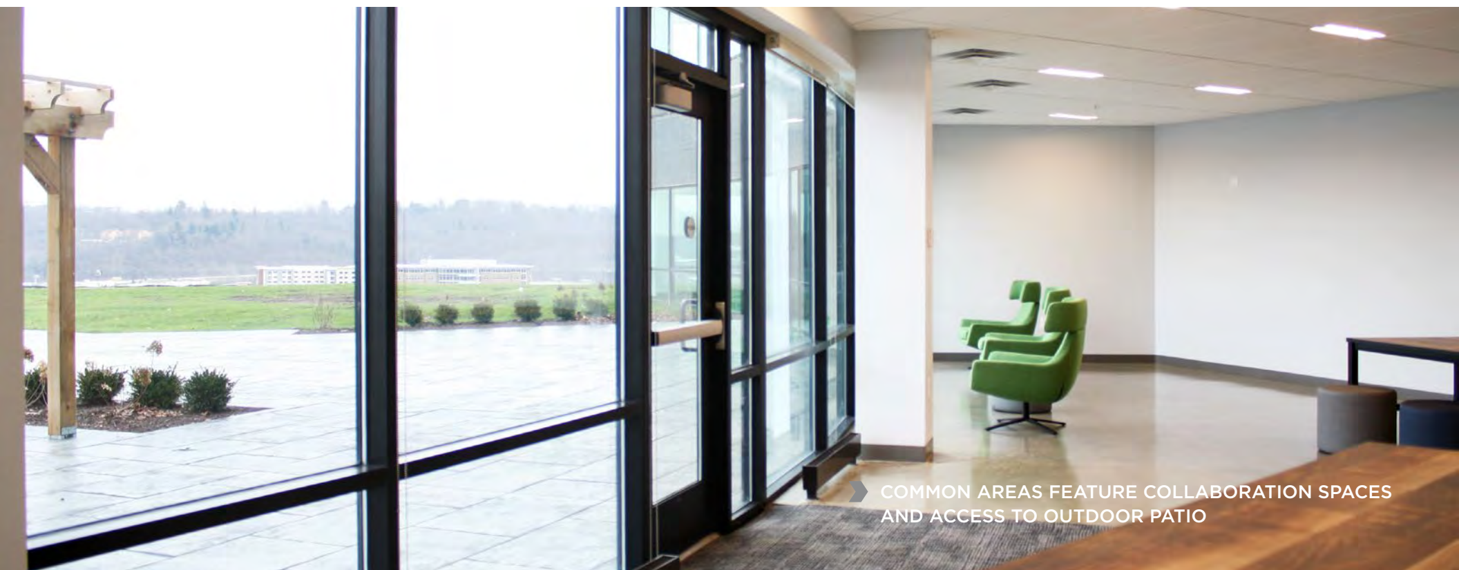
➤ COMMON AREAS FEATURE COLLABORATION SPACES AND ACCESS TO OUTDOOR PATIO